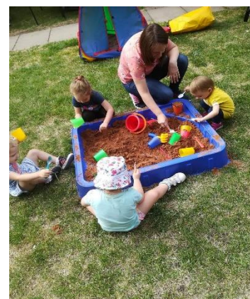
Toddle Time's outdoor messy play day at the end of the summer term.

signing people in, doing the crafts or socializing with the children and their carers. It is a group enjoyed by local families as well as some outside of the area.