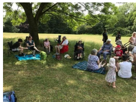
Our Parish picnic

And at the reading group we have read another 7 books, with authors including Corrie Ten Boom, Rob Parsons and Adrian Plass. It's lovely to be able to share ideas with friends, and suggestions for any new reads are always very welcome.