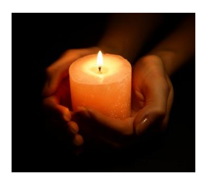
+ St. Matthew's + Parish of Edgeley and Cheadle Heath